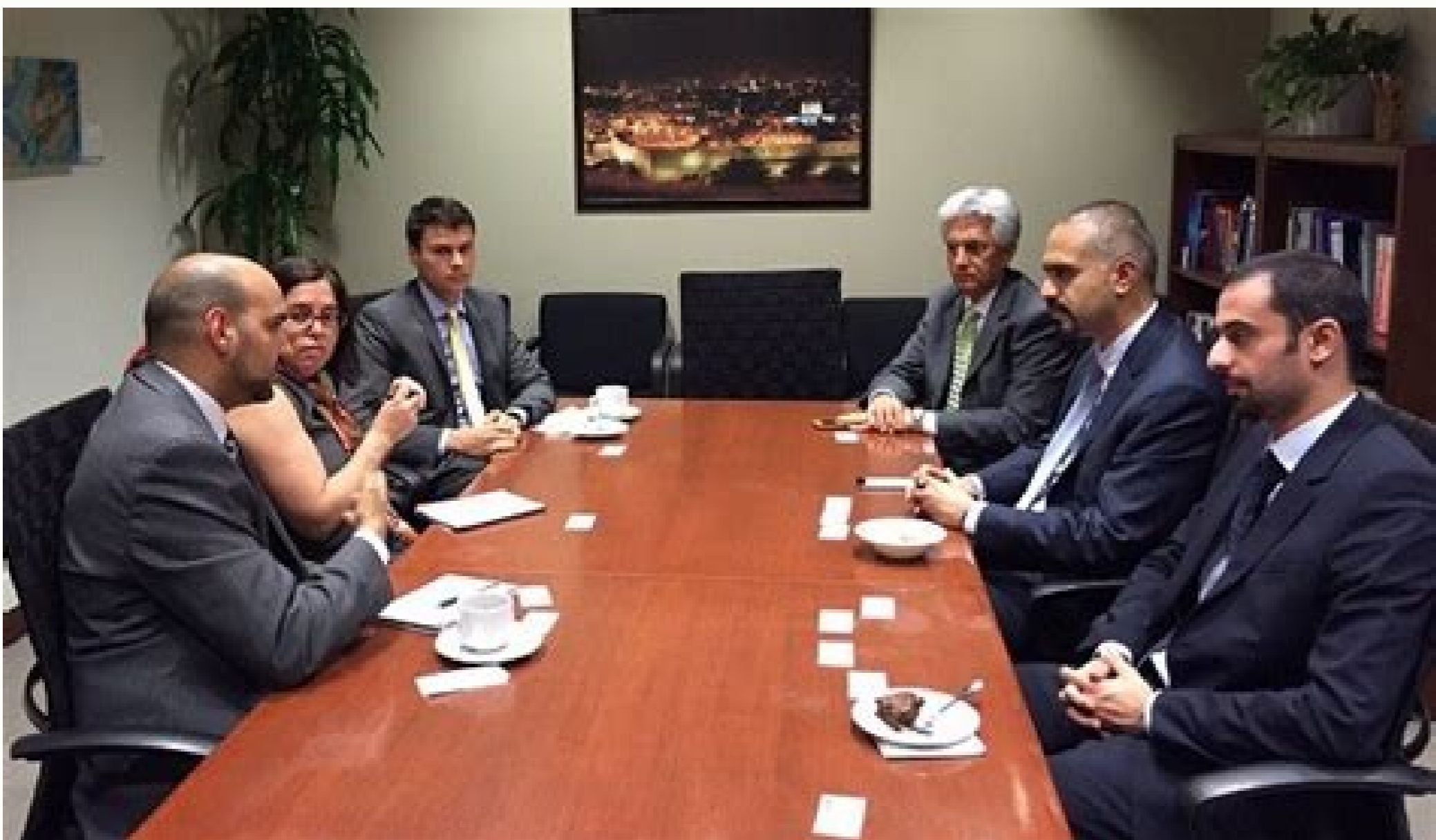
Kuwait investment authority annual report.