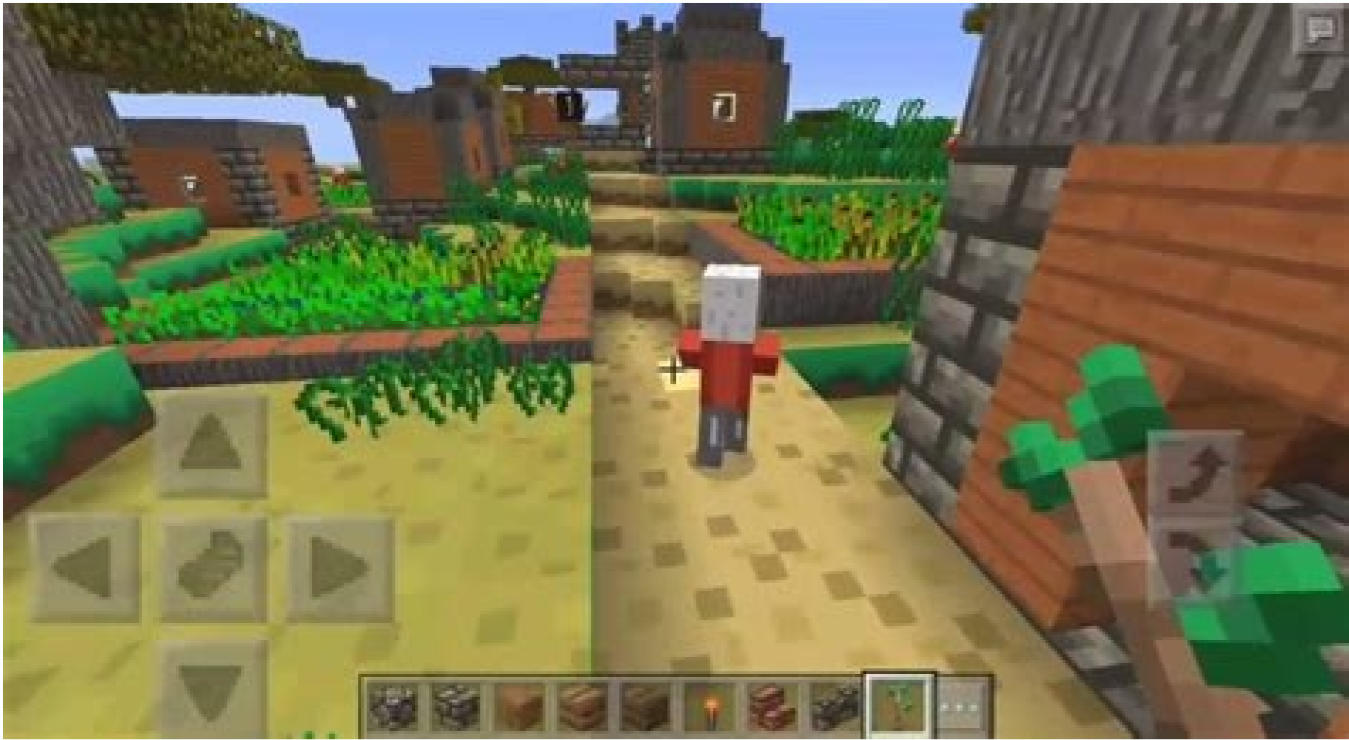
Rtx texture pack minecraft pe free download android. Minecraft pe modern texture pack android. Faithful hd 32x32 texture pack for minecraft pe ios/android 1.16. Texture pack minecraft pe android download. Cara memasang texture pack minecraft pe android. Rtx texture pack minecraft pe android. Fnaf texture pack minecraft pe android. Best texture pack for minecraft pe android.